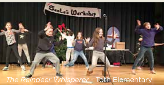
The Reindeer Whisperer - Toth Elementary

Last school year, eight students were accepted into the Ohio Music Education Association All-State Orchestra, and one was accepted into the Ohio Music Education Association All-State Choir.