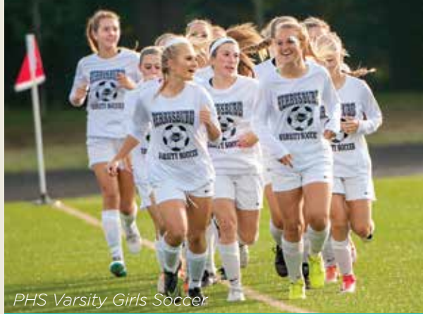
PHS Varsity Girls Soccer

A successful school district places a high degree of importance on ensuring that all students have the opportunity to achieve their greatest potential inside and outside the classroom. This Quality Profile looks at six areas that demonstrate the educational value of our school district in areas that matter most to our community.