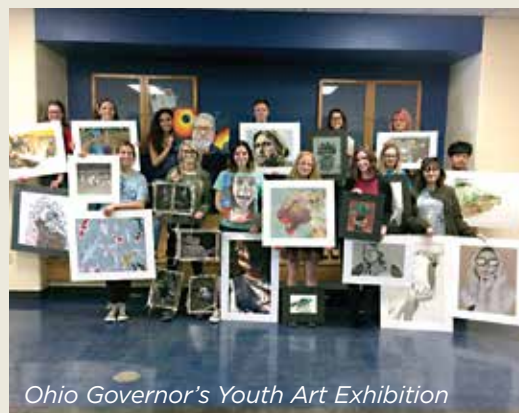
Ohio Governor's Youth Art Exhibition