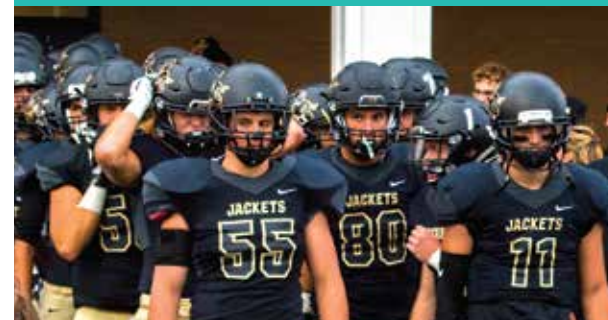
PHS Varsity Boys Football