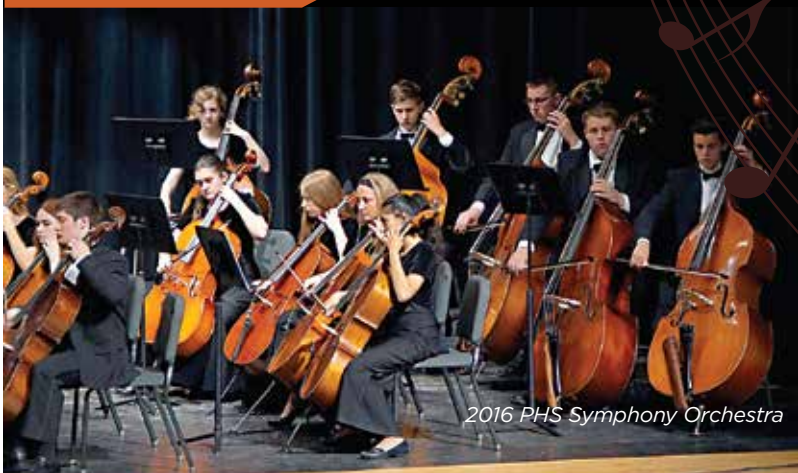
2016 PHS Symphony Orchestra

The PHS Symphony Orchestra performs four concerts a year and has received Superior I ratings four straight years from OMEA State Orchestra Competition. The Symphony Orchestra Fall concert is scheduled for November 16 at PHS at 7:00 p.m. They will perform selections from Mussorgsky, Tchaikovsky and music from the popular Broadway musical Wicked .